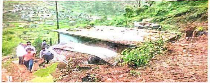
टिहरी जिले के तोली गांव में पहाड़ी से हुए भूस्खलन की चपेट में आने से ध्वस्त मकान, जिसमें मां बेटी की मौत हो गई, जबकि तीन अन्य सदस्यों ने भागकर जान बचाई

टिहरी जिले के ही झाला गांव में धर्मगंगा नदी के उफान में श्रमिकों की झोपड़ी बही, मां-बेटी लापता