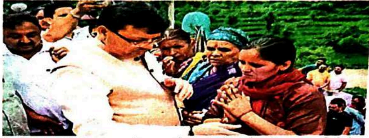
टिहरी जिले के भिलंगना ब्लाक में जखन्याली गांव के नीताइ तोक में आपदा प्रभावितों से मिलते मुख्यमंत्री पुष्कर सिंह धामी संबंधित समाचार >> पेज 6

• वर्षाजनित हादसों में उत्तराखंड में 24 • 4,000 तीर्थयात्री निकाले, लगभग एक हजार अब भी धाम में फंसे