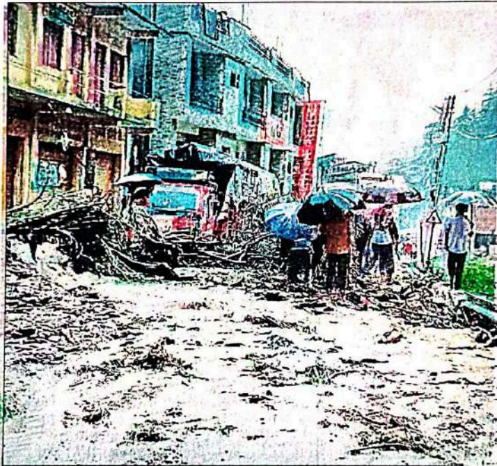
Flooded roads and uprooted trees were reported in the Jageshwar Dham area of Almora area following intense spell of rain: SDRF stranded villagers after the collapse of a bridge on the Ghansali-Kedarnath road in Rudraprayag district on Thursday.