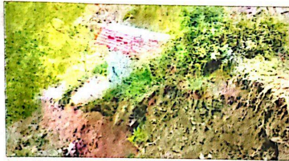
सिल्याण में भूस्खलन की जद में आई गोशाला।